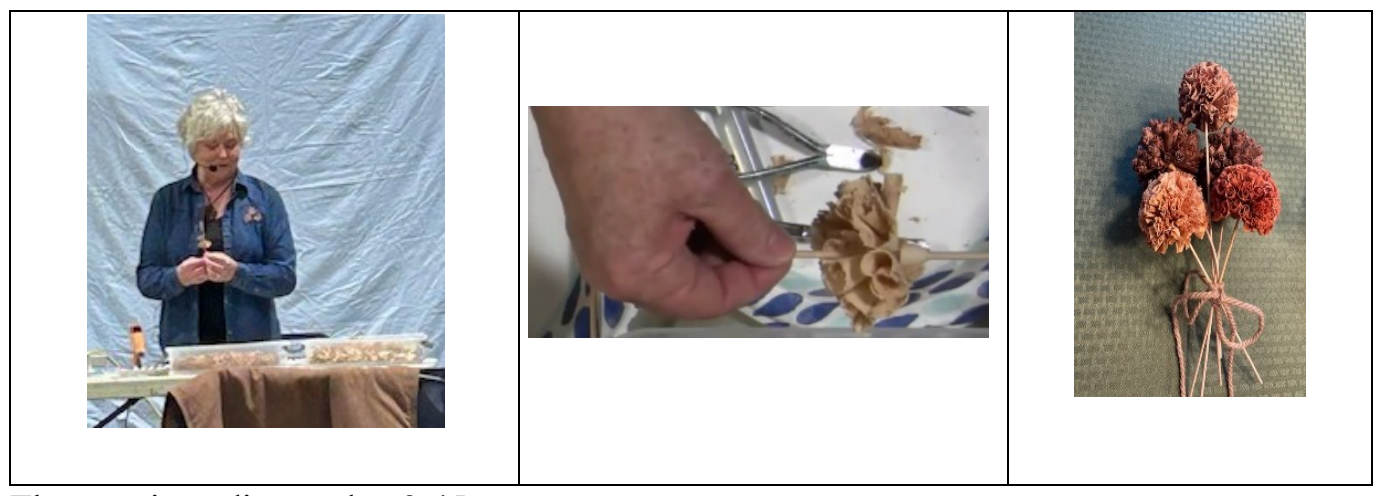
The meeting adjourned at 2:45 p.m.

Ginnie O'Brien gave the second demonstration. After watching Larry's wood shavings from a Forstner bit fall to the floor, she had the idea of collecting them to see if she could turn them into flowers or an ornament. She gathered them into tubs and experimented first with floral wire and tape but learned that using skewers with a wooden bead for support worked best. She used hot glue to place the shavings around the bead and built outward, filling in the area with shavings until she achieved the shape of the flower. When she makes an ornament, she builds it on both ends of the bead until she has a round shape. If she wants a color added, she dyes the shavings before glueing them together. Lacquer stiffens the petals of the flowers to make them sturdier.