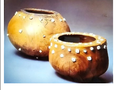
If you want to know why there are teeth on this bowl, watch the video!